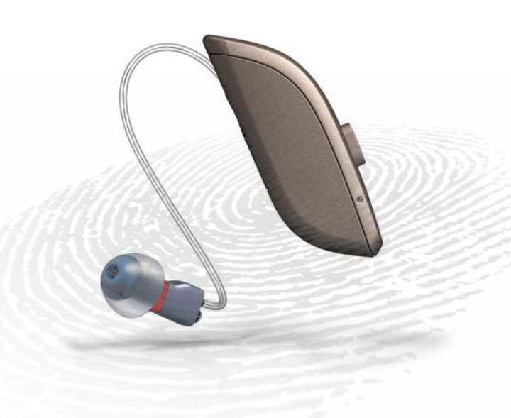
{\rm *Microphone}\ in\ ear\ and\ two\ standard\ directional\ microphones, directionality\ features, wireless\ audio\ streaming.

Add convenient direct audio streaming, access to remote hearing care services, and industry-leading battery life, ReSound ONE truly keeps you connected to people and technology you need to become ONE with your world.